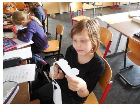
Copying the outlines of our partner countries from a big map