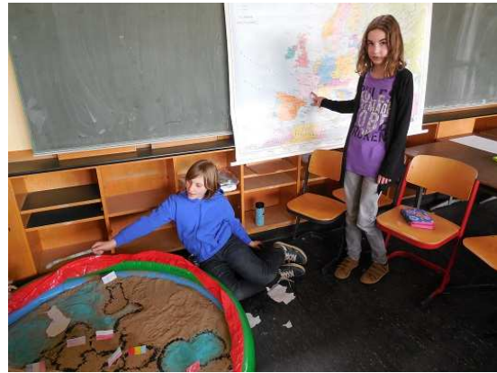
This is fun and hard work!