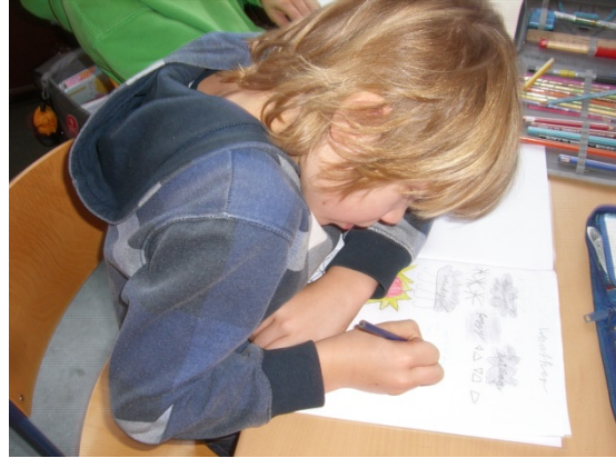
Writing into our Treasure chest.