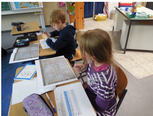
Collecting data and comparing it in May 2013.