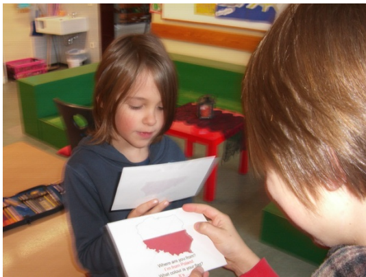
Interviewing each other and learning basic sentence structures. Content: Our partner countries and the colours at the beginning of year 3.