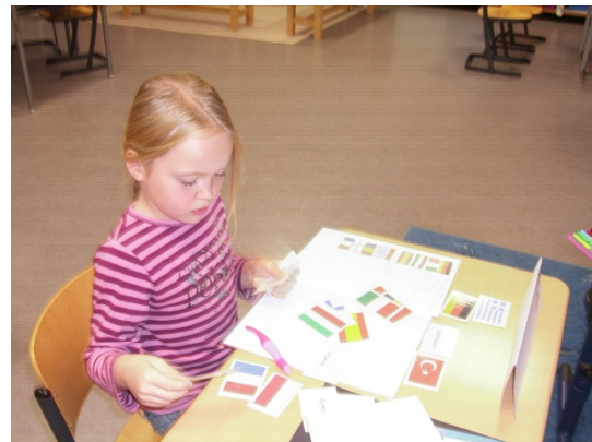
Special needs year 3: Getting to know our partners. Matching the the countries and the flags.