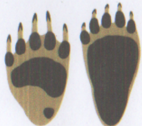
patte antérieure patte postérieure