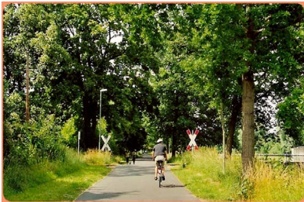
The Leine-Heide bike way

There are several nature reserves near the Leine .