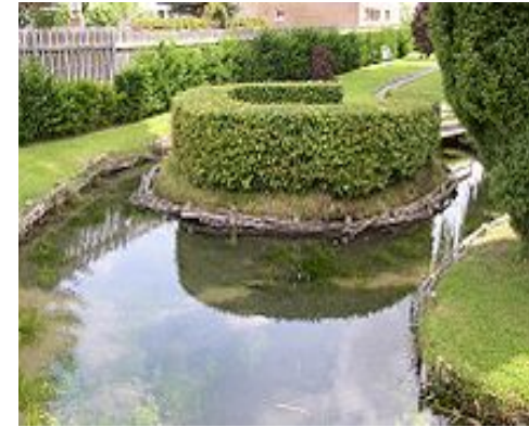
The sources of the river

Its source is 340 meters above sea level in the state Thüringen in Leinefeld. It is a landmark .